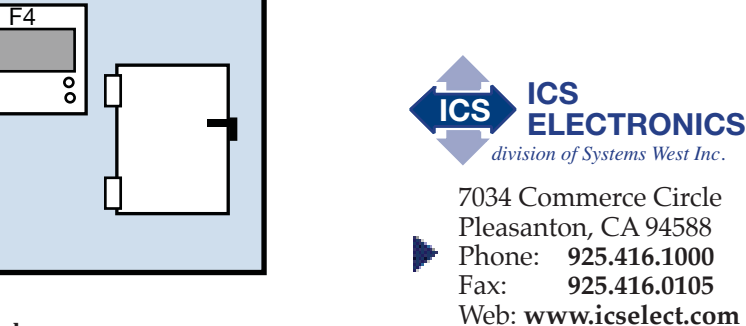
A 9099 controlling a Temperature Chamber