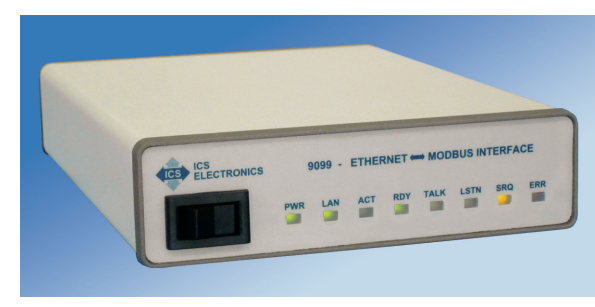
9099 Ethernet-Modbus RTU Interface

an LXI compatible instrument and can be found with the VXI-11 Discovery procedure.