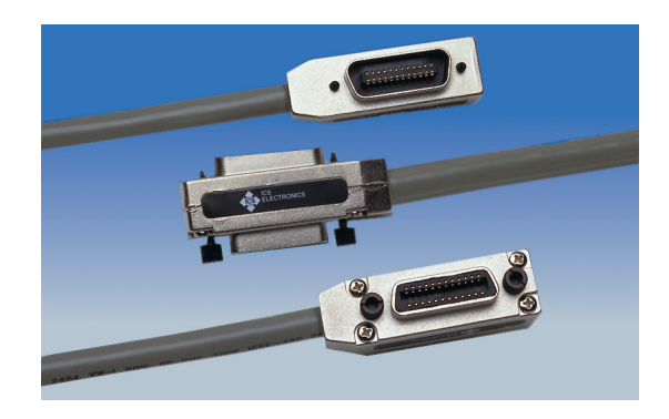
Dual-Ended Stackable Connectors

ICS's IEEE-488 Bus Cables are available in two styles. The first style is the standard GPIB cable with dual-ended connectors at each end of the cable for stacking multiple cables on one GPIB The second style has a connector. straight-in connector on one end of the cable for connection to devices with limited panel space, or where the bend radius is too tight for a standard cable or where there is not enough room for the standard cable to lay along the rear of the device. The connector at the other end of the straight-in cable is the standard double-ended connector.