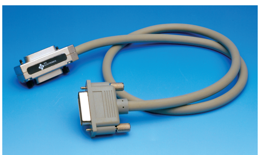
1057XX Series IEEE-488 Cables with Straight-in Connector on one end