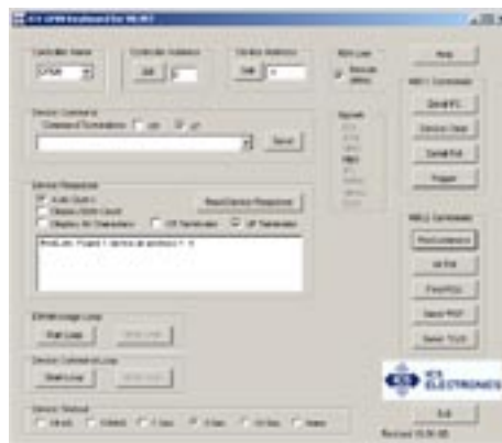
GPIB Keyboard Window

The 1105 includes an enhanced version of ICS's Keyboard Controller program for Windows which provides interactive control of GPIB devices from the computer keyboard without having to write a program. The Keyboard Controller program is the ideal utility program for testing the 1105 Controller, for exercising GPIB devices or for trying out device commands before using them in a program.