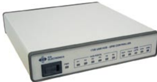
USB-to-GPIB Hub Controller