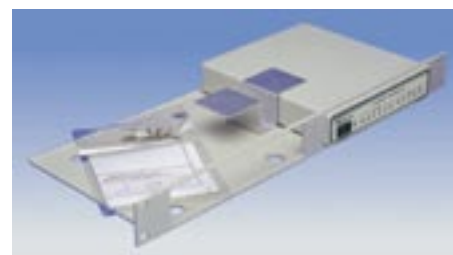
Dual Large Rack Mounting Kit

The 1105 is designed to be rack mounted or used on a bench top. All GPIB and USB connections are made on the rear panel. The front panel contains the power switch and the diagnostic LEDs which display USB and GPIB bus status. The 1105 can be rack mounted by installing it in one of ICS's Minibox™ rack mounting kits. The kits require only a 1 U high space and fit in a standard RETMA or DIN 19 inch wide rack.