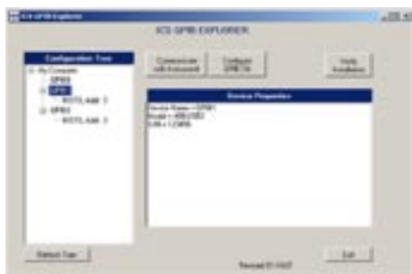
ICS Explorer Main Window

From the Tree window you can examine every device, link to the Configure and Communicate with Instrument forms or verify the software installation. The Configure form lets you quickly view and change the Controller's settings. The Communicate with Instrument form lets you interactively control any GPIB device from the computer keyboard without having to write a program. The Communicate form is ideal for testing the Model 1105, for exercising GPIB devices or for trying out device commands before using them in a program.