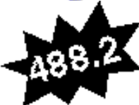
4894B GPIB-to-Serial Interface

422/RS-485 differential signals and operates in full or half-duplex mode for compatibility with RS-485 network devices.