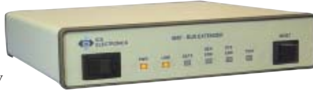
4897 Bus Extender

The IEEE-488 Standard limits the GPIB bus distance to a maximum of 20 meters with 2 meters of cable between devices for full data transfer rates. The IEEE-488 Standard also limits the number of devices that the System Controller can drive to 14. ICS's 4897 series Bus Extenders overcome both limitations by extending the maximum cable distance up to 15 km and by adding drive capability for 13 additional devices.