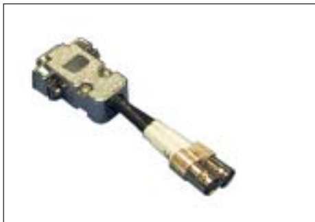
Figure 2 DE-to-BNC Adapter

The 4897's metallic cable interface is a DE-9S connector for easy connection to twisted shielded pair cable. A DE-9 to BNC Adapter provides two female BNC connectors for connecting dual coaxial cables to the 4897 or to the 4897L.