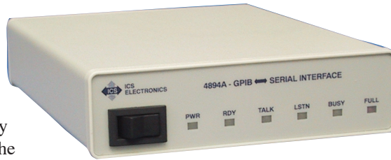
4894B GPIB-to-Serial Interface

The 4894B's programmable serial interface includes both RS-232 single-ended and RS-