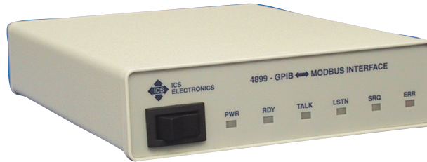
4899A Modbus Interface

The user sends simple commands to the 4899A that sets the Modbus device address, specifies the Modbus device register to be read or written to and the data value. The 4899A converts these commands into the Modbus RTU format, adds the CRC checksum and transmits the messages to the Modbus device. Received messages are checked and the responses to queries are outputted to the GPIB bus when the 4899A is next addressed to talk.